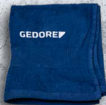
GMH990021 Sports towel 3114872