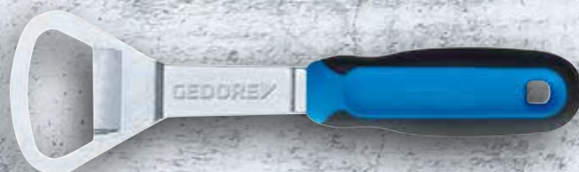
GMH9900007 Bottle-Opener 2K GEDORE 2979322