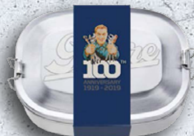
GM0990043 Lunch box metall GEDORE Retro 100th 109232