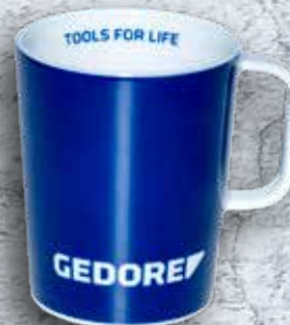
GM0990040 Coffee mug GEDORE blue 3109348