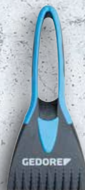
GMH9900012 Ice scraper GEDORE 2981882