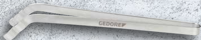
GMH9900008 Barbecue Tongs GEDORE 2981890