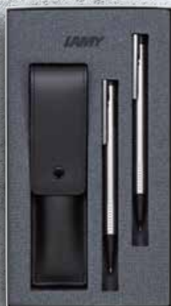
GM0990017 Ball pen Set LAMY GEDORE 3099377