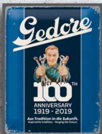
GM0990042 Tin-plate sign GEDORE Retro 100th 3109224